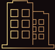
RESIDENTIAL TOWER IN LIWAN