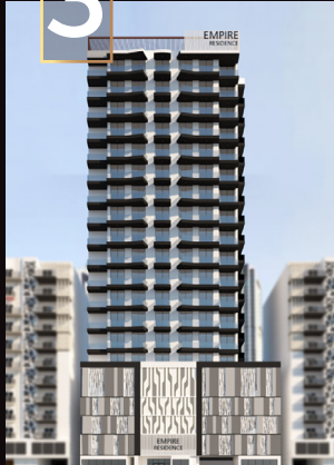
EMPIRE RESIDENCE - JVC