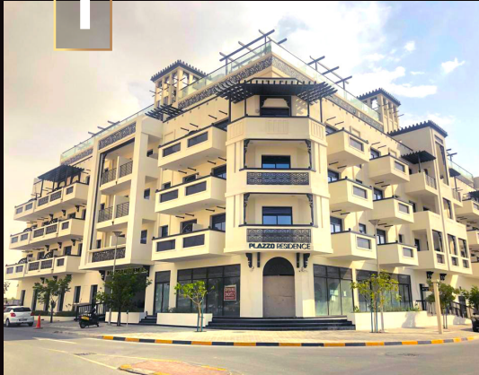
PLAZZO RESIDENCE - JVT