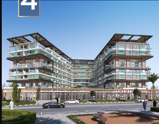
EMPIRE ESTATES - ARJAN