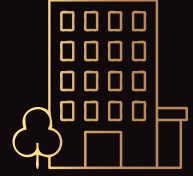
RESIDENTIAL TOWER IN JVC