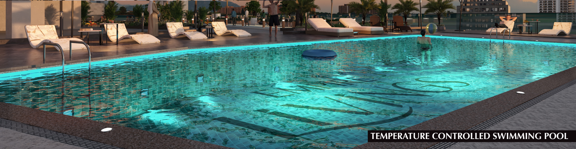
TEMPERATURE CONTROLLED SWIMMING POOL