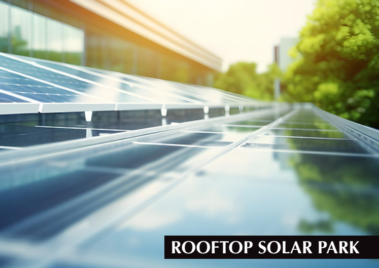
ROOFTOP SOLAR PARK