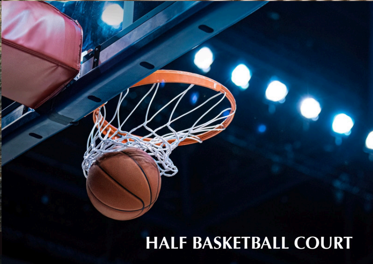
HALF BASKETBALL COURT