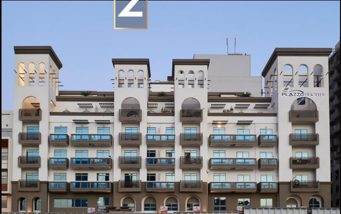
PLAZZO HEIGHTS - JVC