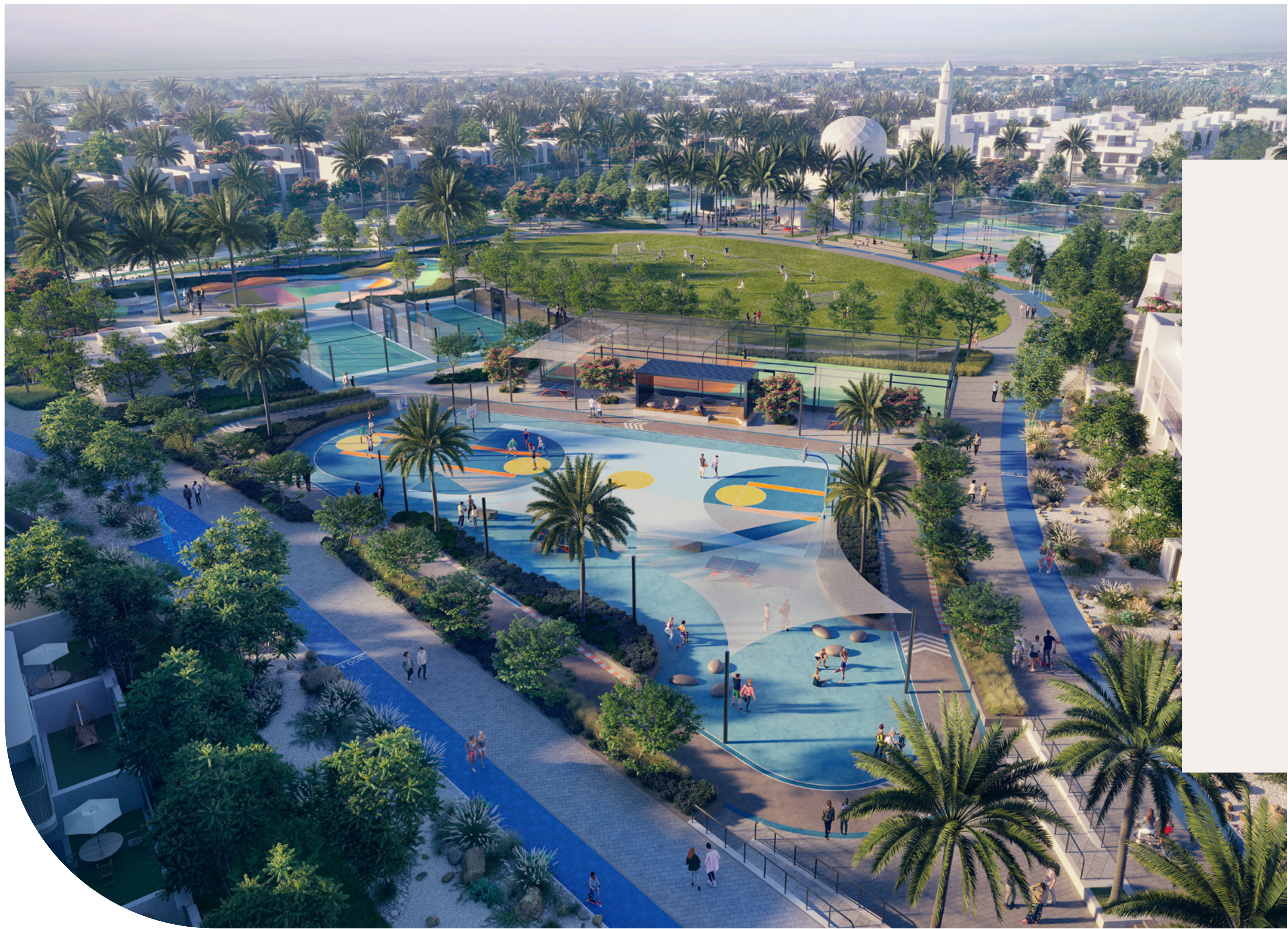
THE VALLEY PARK