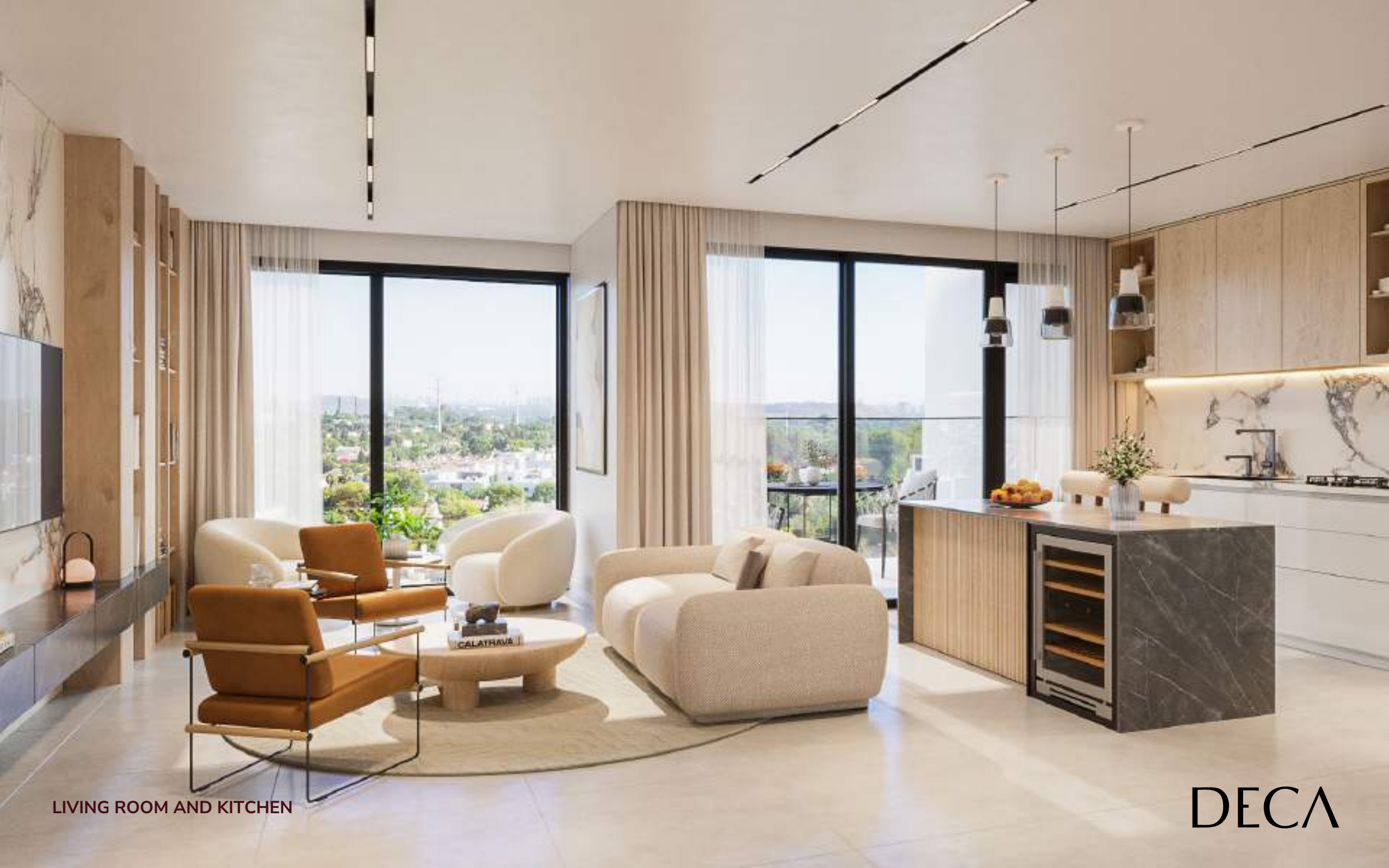
LIVING ROOM AND KITCHEN