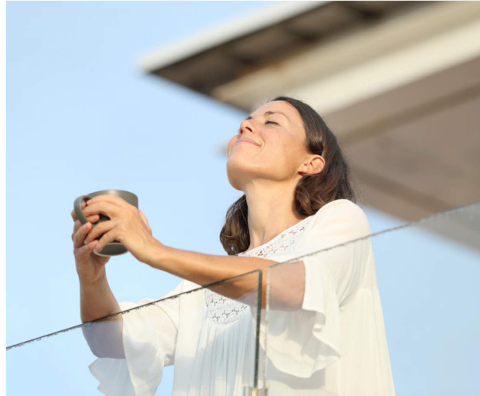
Sun shading elements (balconies & perforated panels)

Extensive landscaping with native plants or adaptable species enhances the property's beauty and value while reducing its environmental impact. Other environmentally friendly features include advanced waste management and water reuse solutions, as well as a bicycle storage area and EV parking to encourage residents to use less traditional combustion engines.