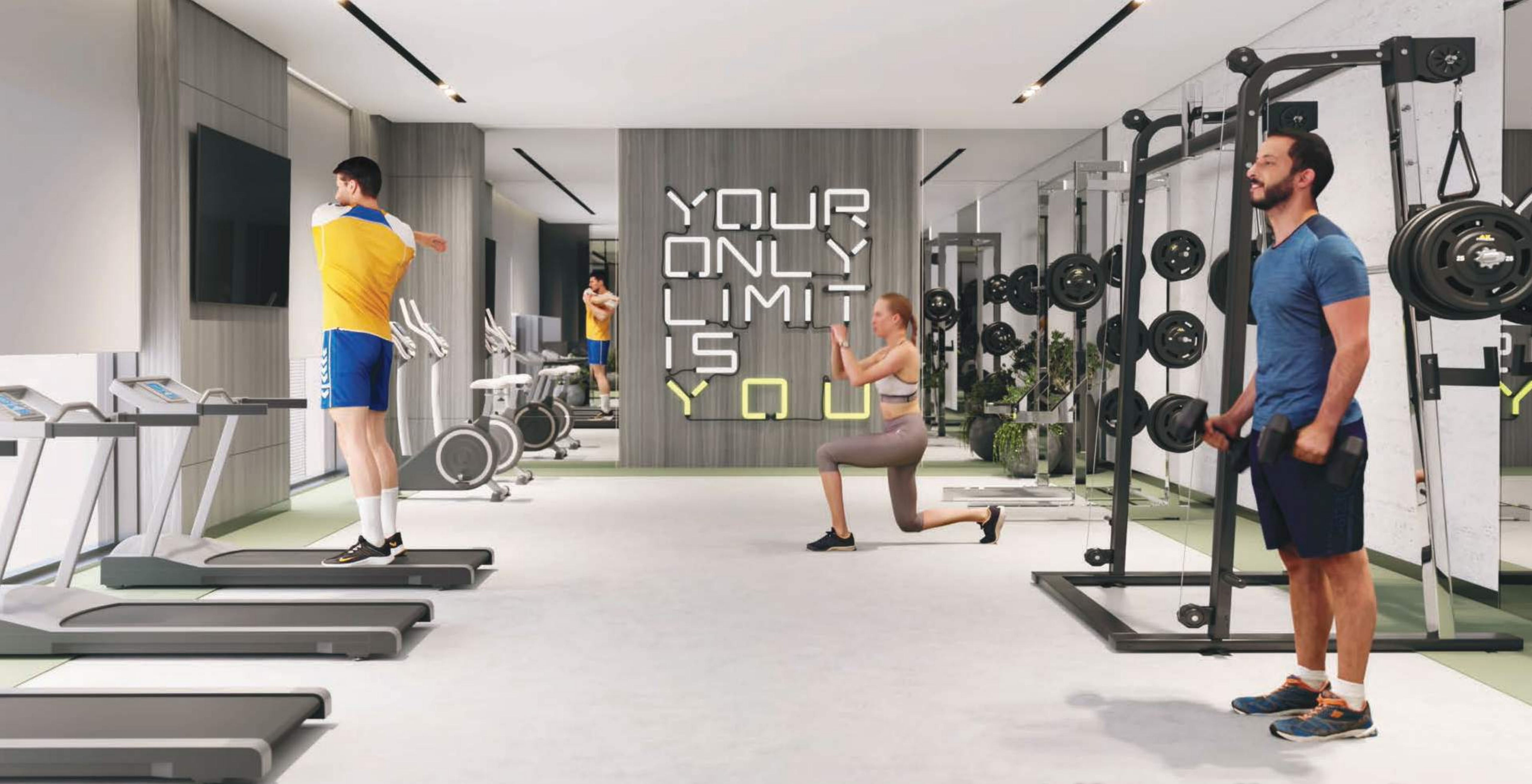
A Holistic Fitness Space