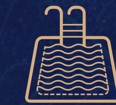
Private Pools Inside Apartments