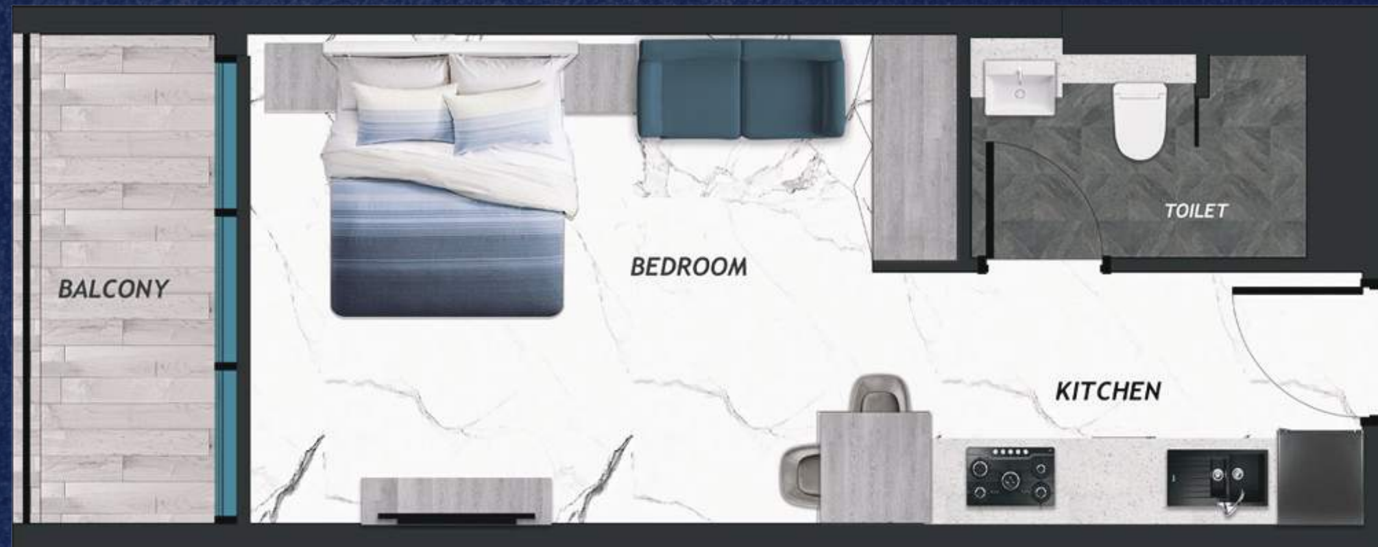
STUDIO WITHOUT POOL