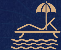
A Luxurious & Large Leisure Pool Deck