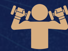
Outdoor & Rooftop Gym