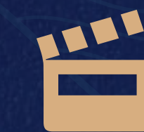
Rooftop Outdoor Cinema