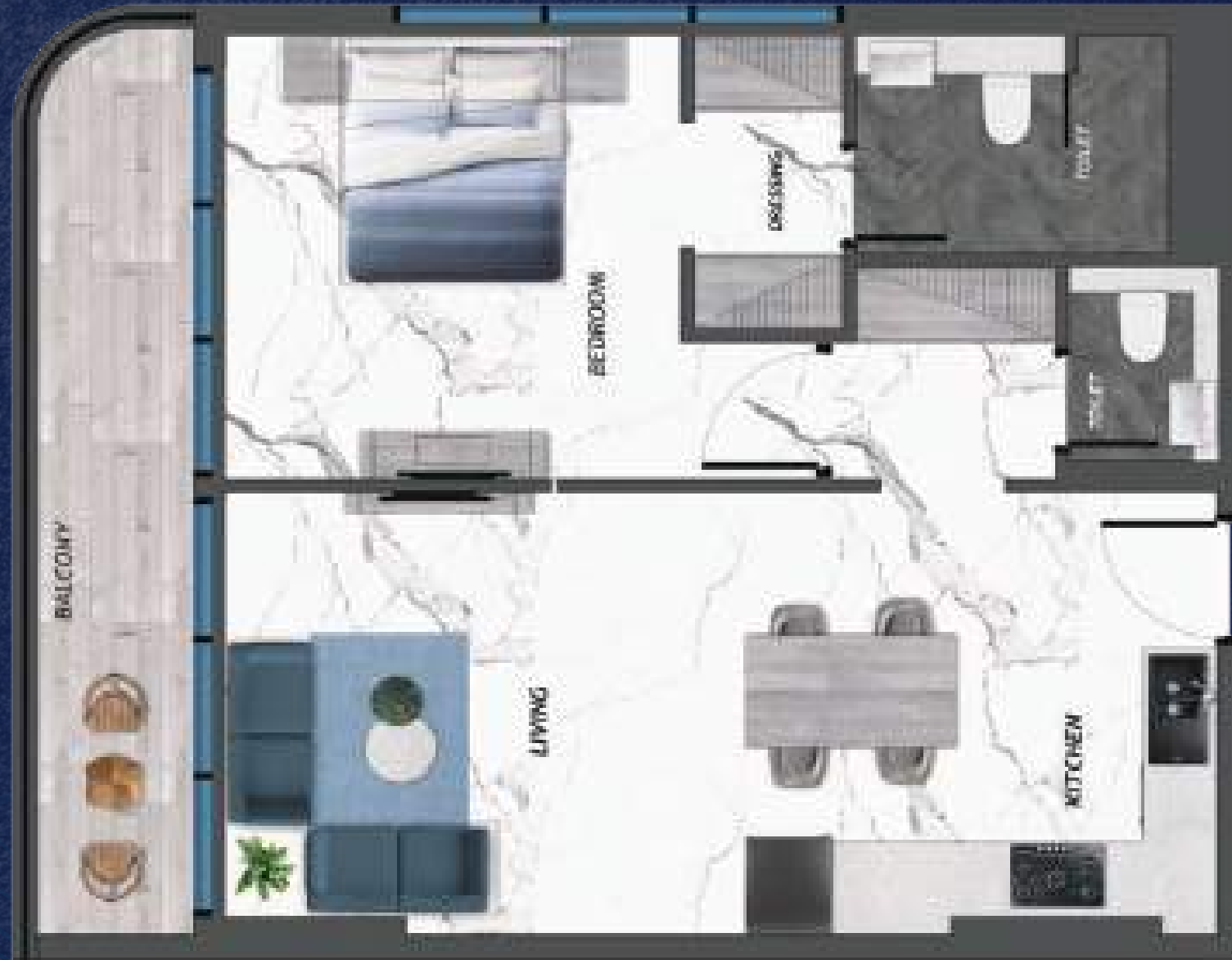
1 BEDROOM WITHOUT POOL