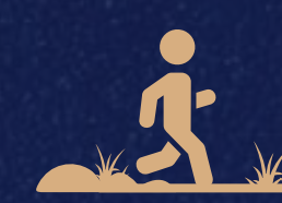
Rooftop Jogging Track