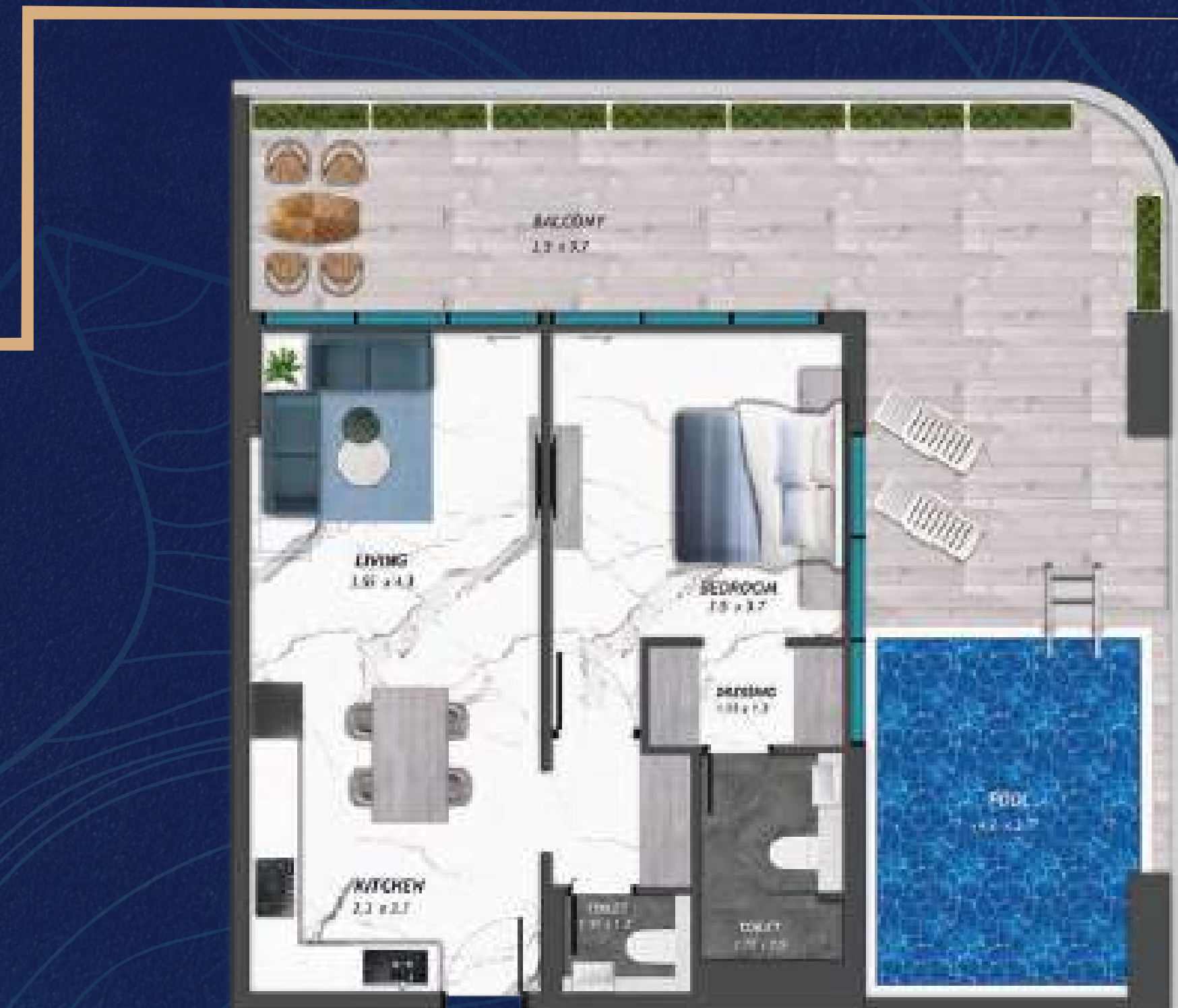
1 BEDROOM WITH POOL