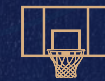
Rooftop Basketball Court