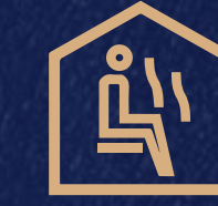
Sauna & Steam Room