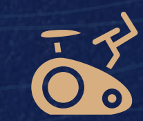
Indoor Health Club