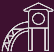
Kids Play Areas