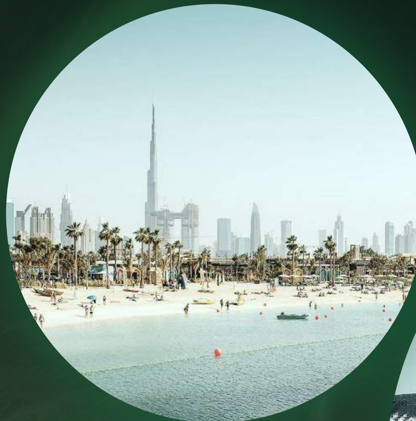
LA MER BEACH