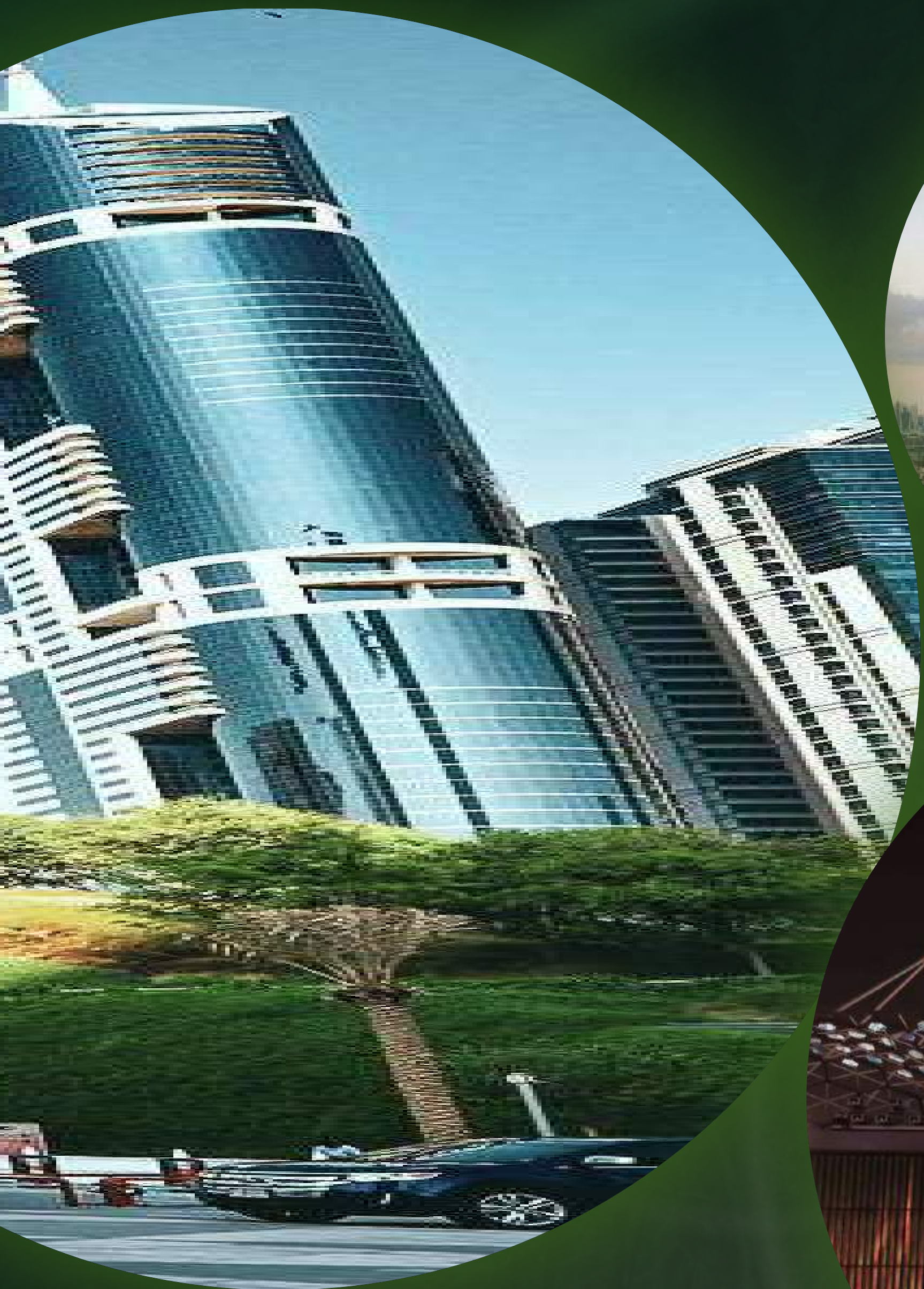
MUSEUM OF THE FUTURE