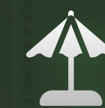
LA MER BEACH