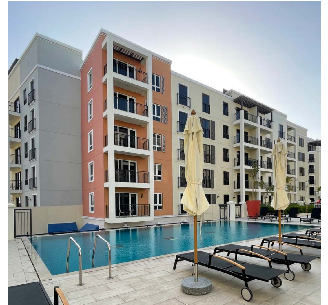
PORT DE LA MER