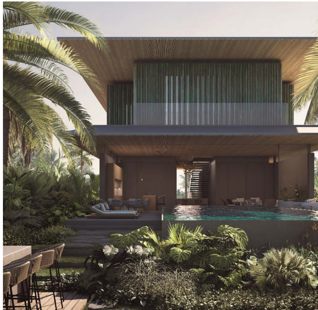
SEA MIRROR RESIDENCE