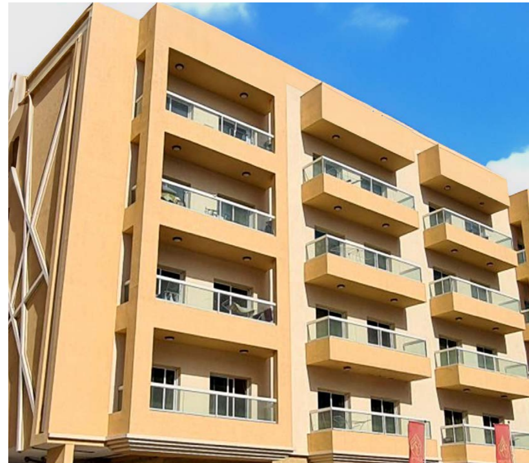
SMART TOWER 1