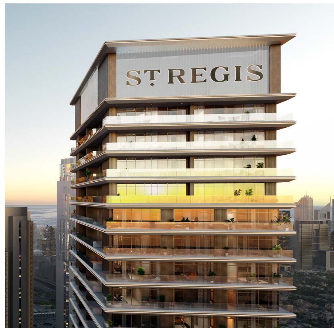
THE ST. REGIS RESIDENCES, FINANCIAL CENTER ROAD, DUBAI