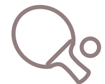
Table Tennis Area