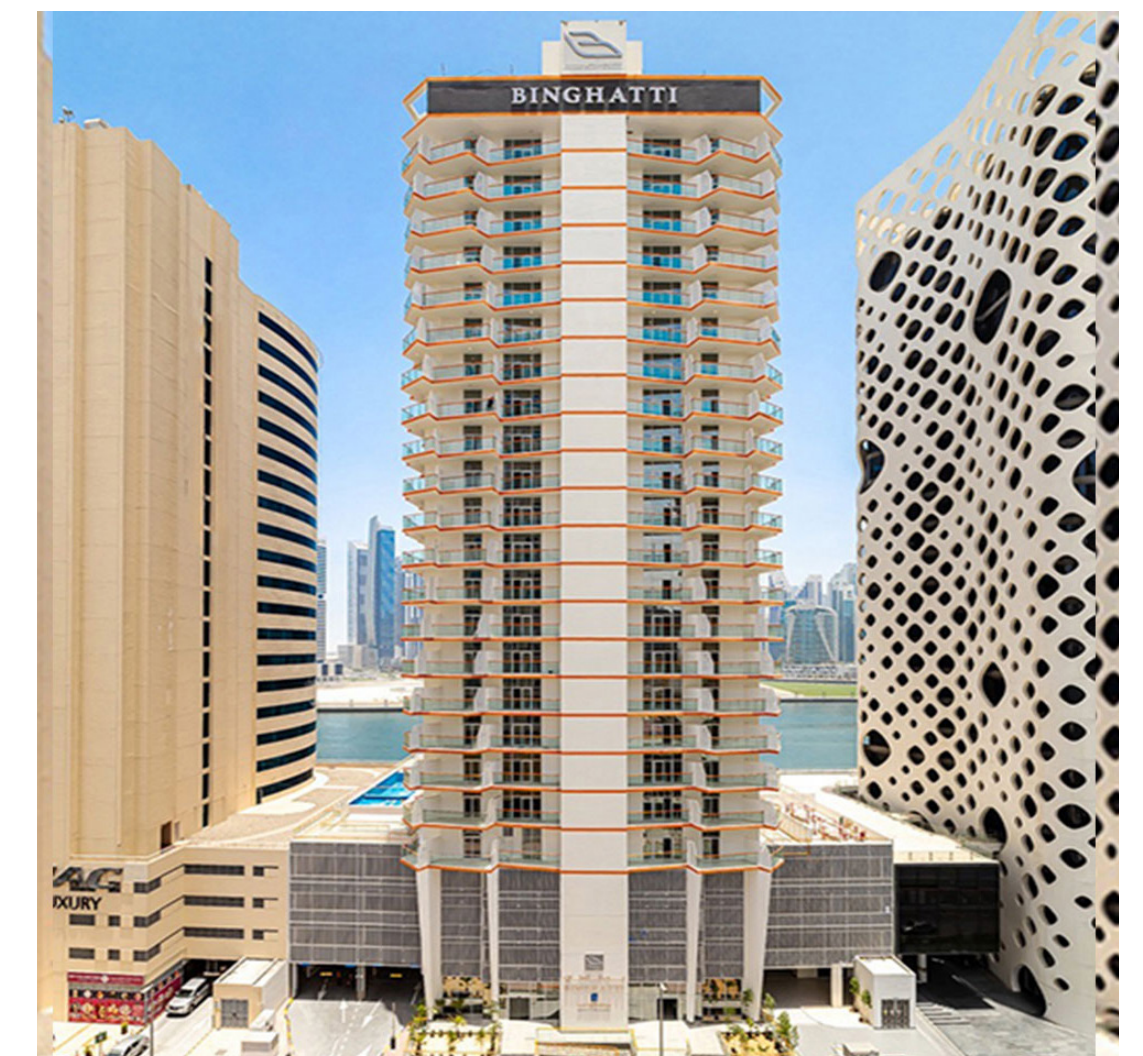
MILLENNIUM BINGHATTI RESIDENCE