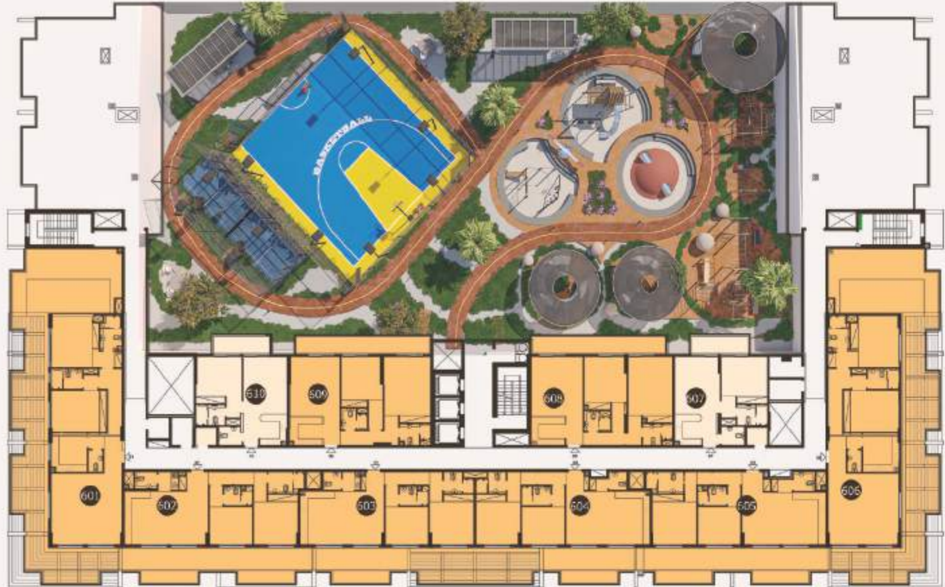
6th FLOOR PLAN