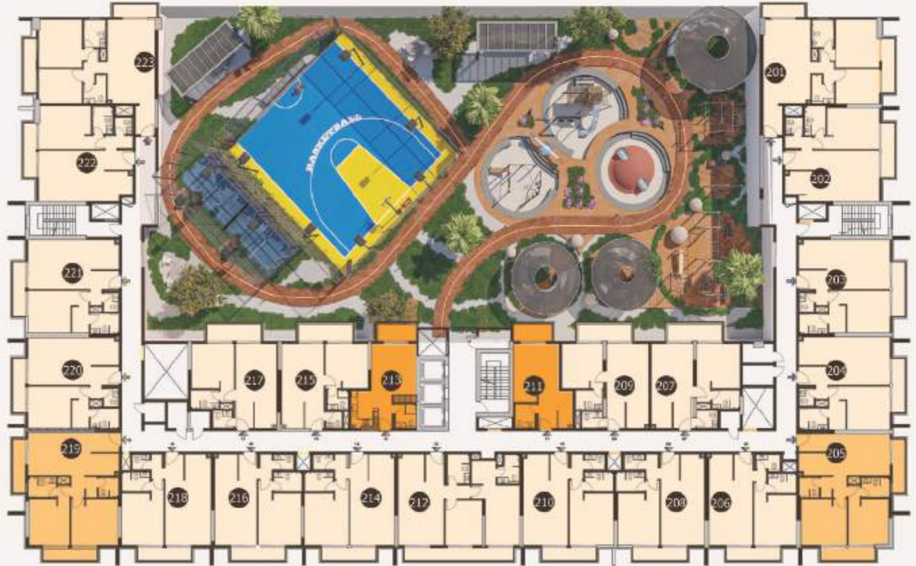
2nd TO 5th FLOOR