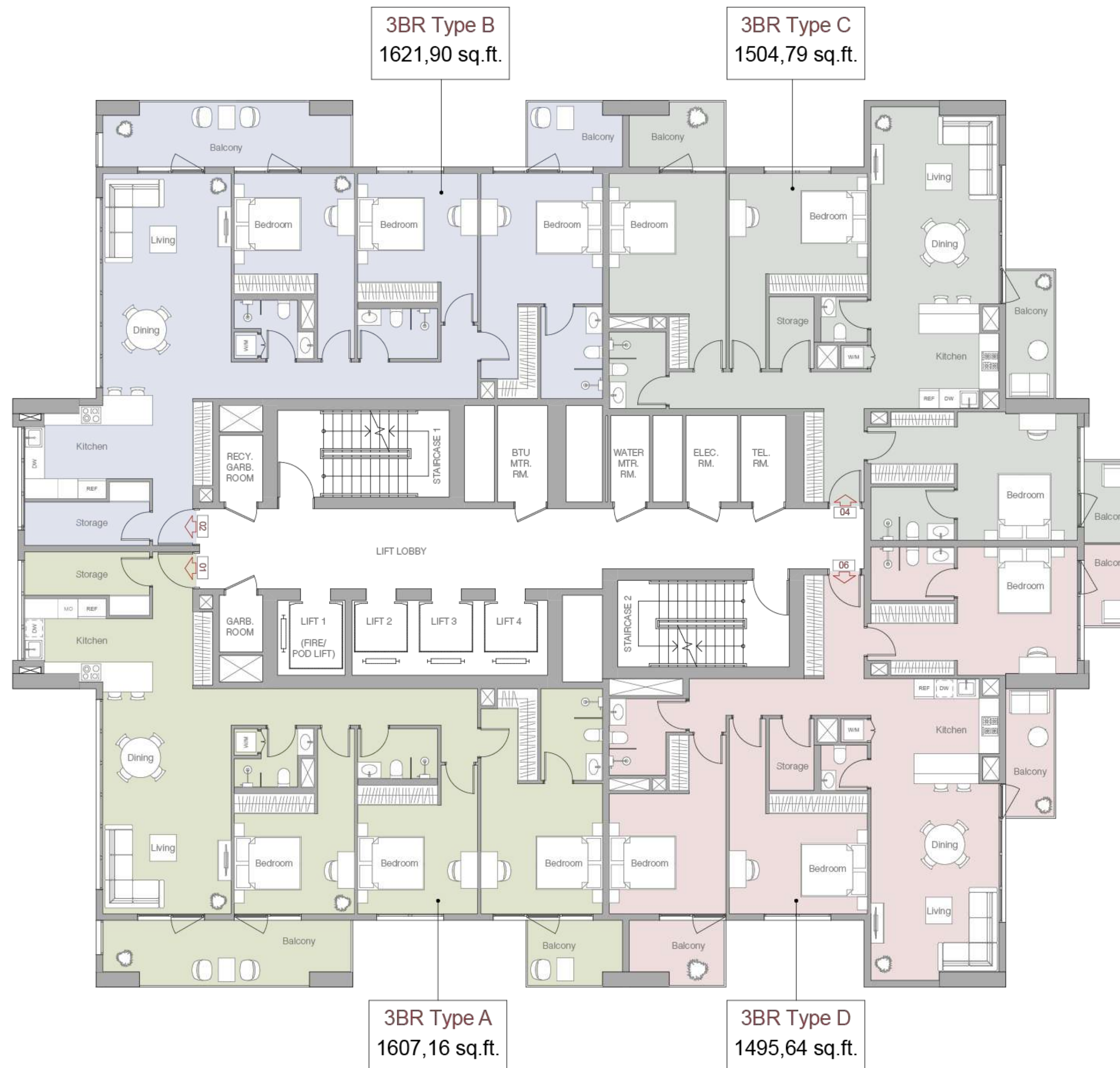
21-22 FLOOR PLAN