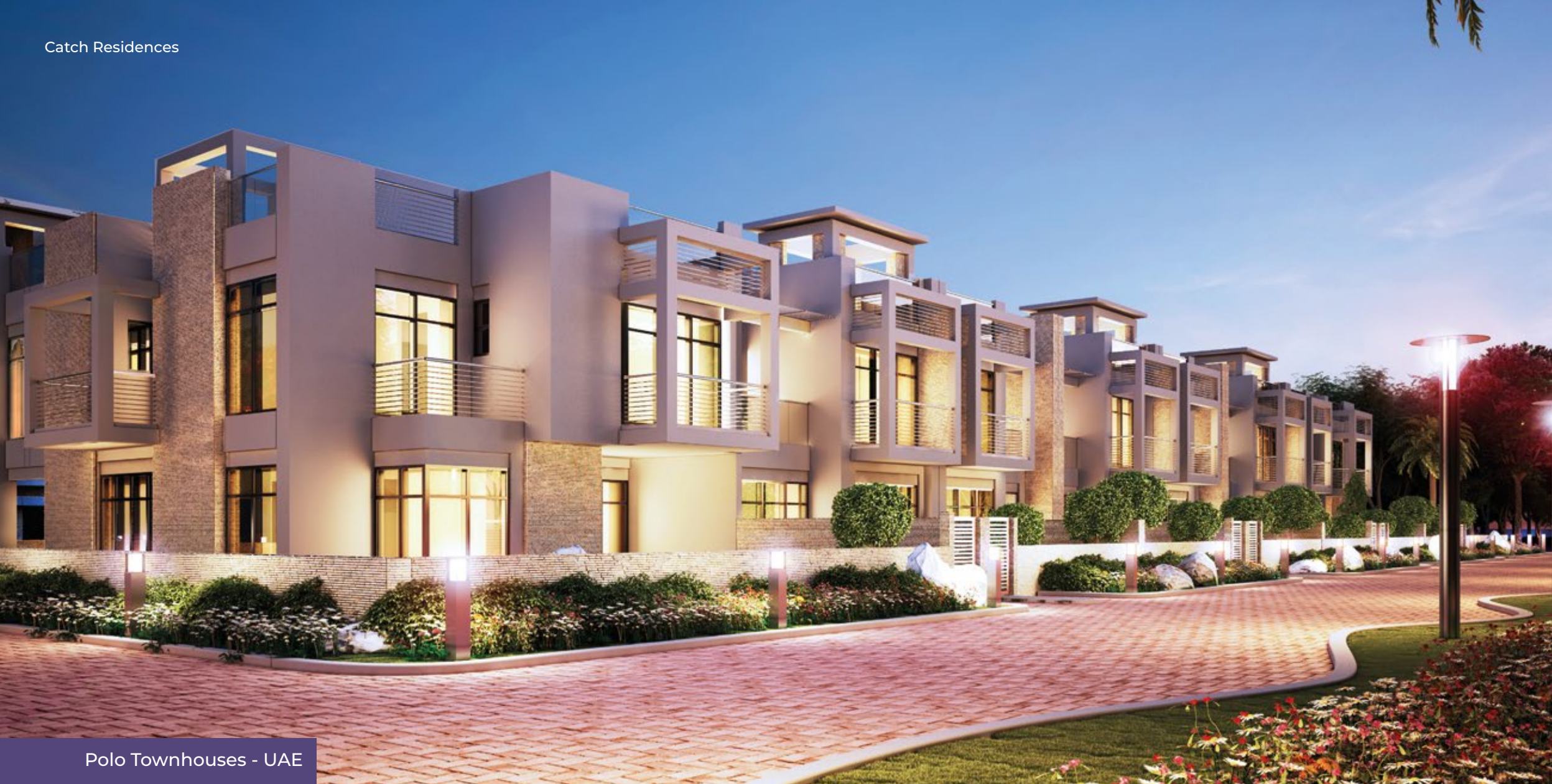
Polo Townhouses - UAE