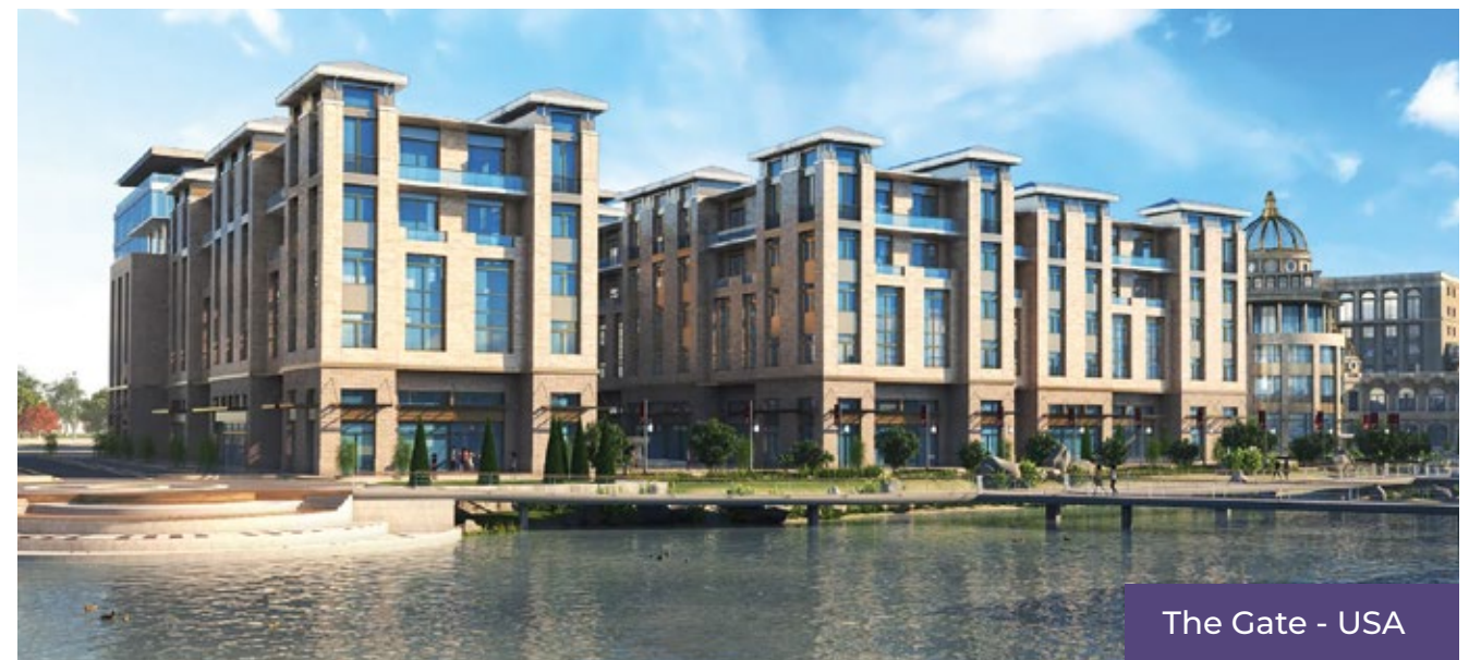
The Gate - USA

Today, an expanded and impressive portfolio of premium properties, which includes some of the most sought-after properties by meticulous clients worldwide, serve as a testament to IGO's well-deserved reputation as one of the top regional investment companies.