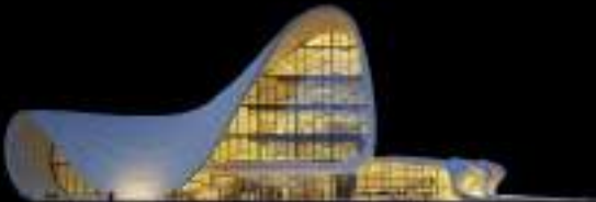
Heydar Aliyev Center, 2012