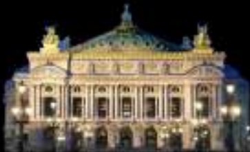
Palais Garnier, 1875