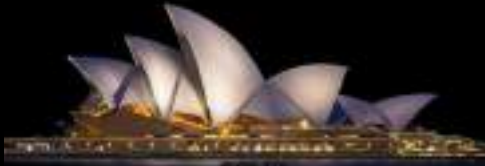
Sydney Opera House, 1973