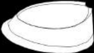
Dubai South Opera House, 2028