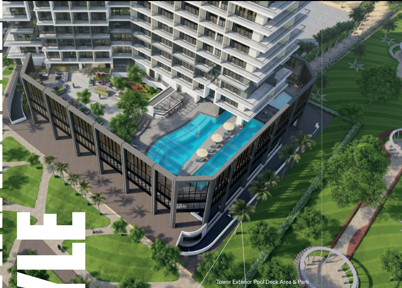
Tower Exterior Pool Deck Area & Park