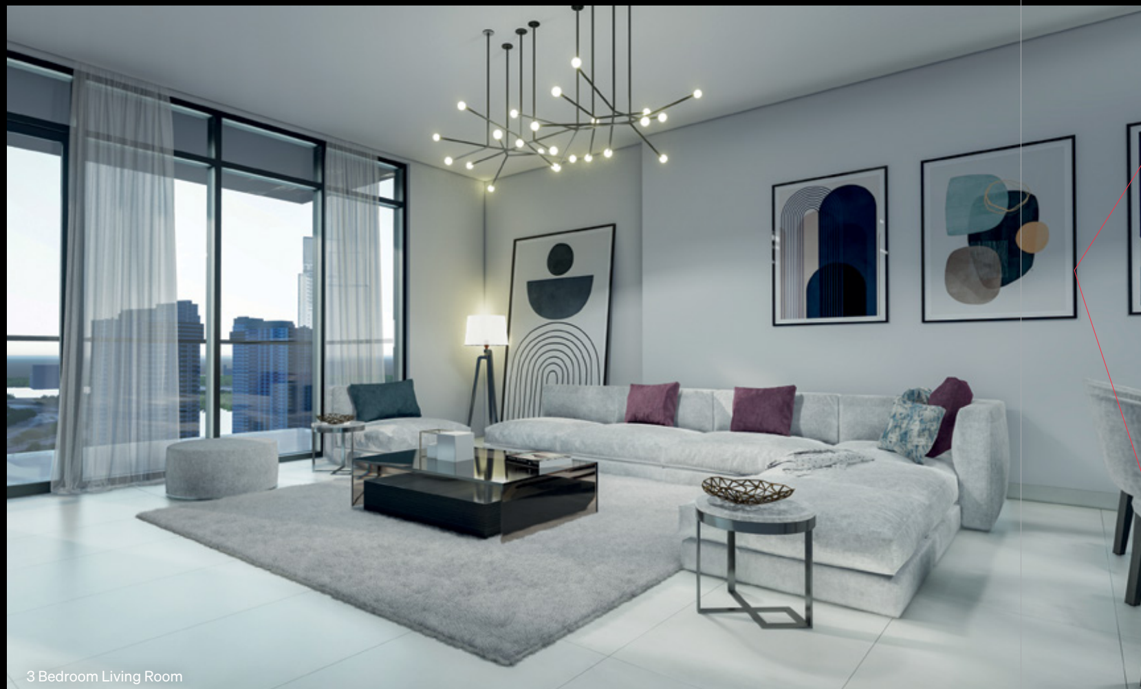
3 Bedroom Living Room