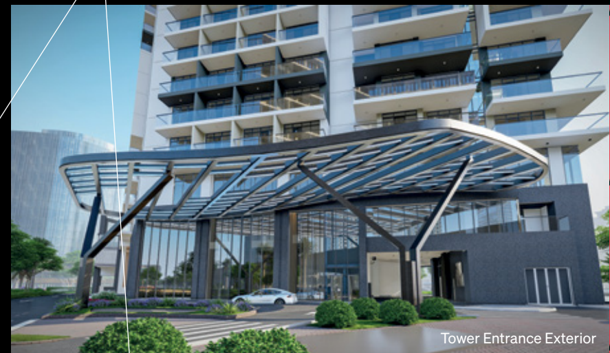
Tower Entrance Exterior