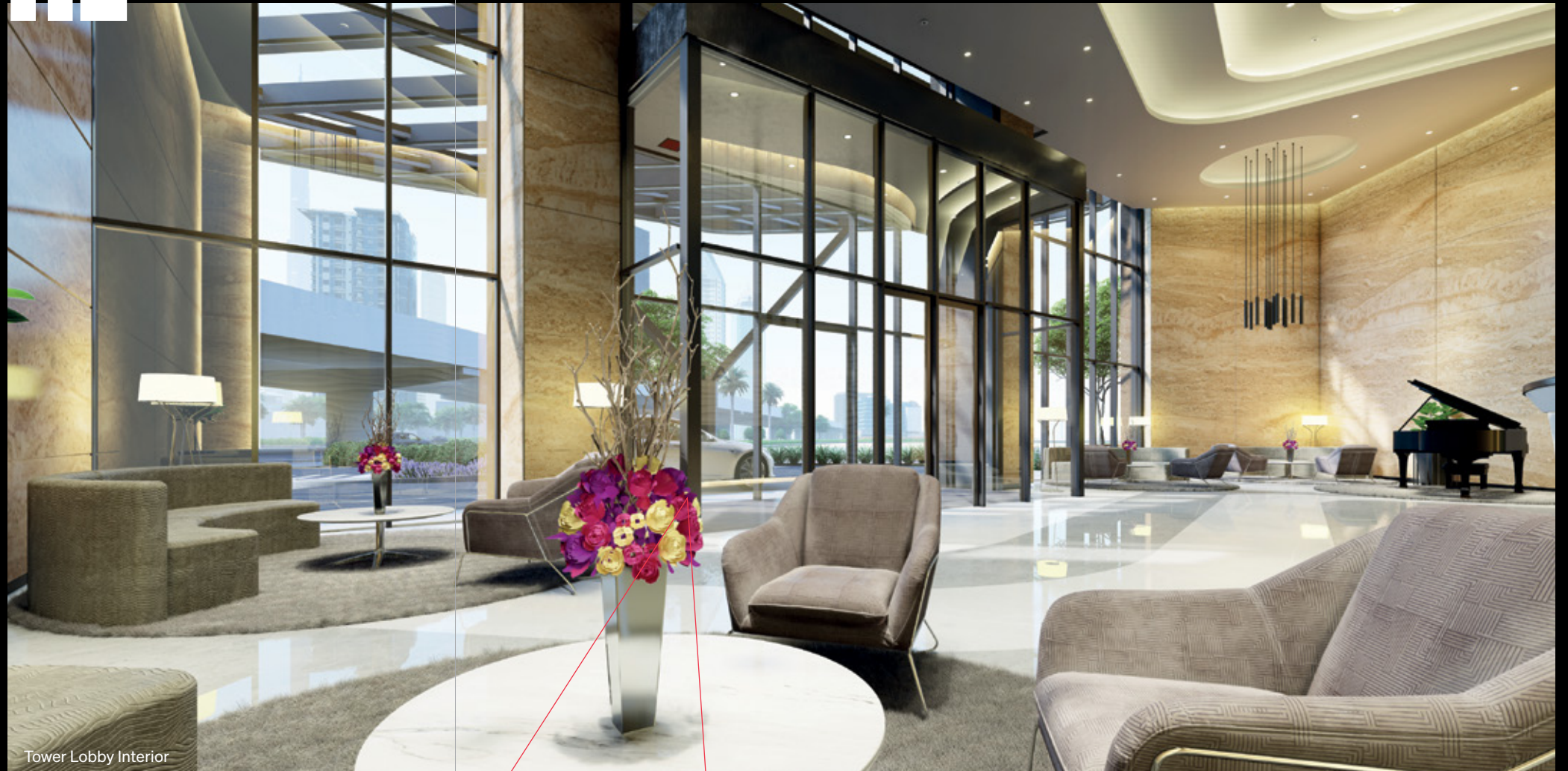
Tower Lobby Interior

THE PARAGON HAS AN EDGY URBAN ARCHITECTURAL DESIGN AND IS BUILT WITH THE HIGHEST QUALITY MATERIALS AND FINISHES, MAKING IT THE DEFINITION OF ULTIMATE SOPHISTICATION.