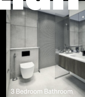
3 Bedroom Bathroom