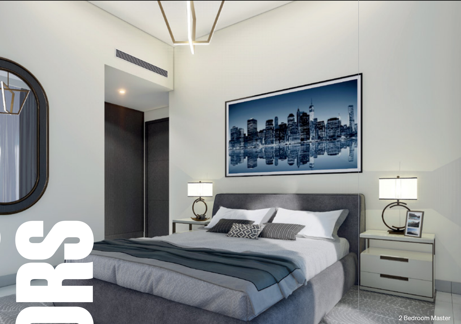
2 Bedroom Master

The Paragon apartments succeed in fusing an upmarket and stylish design with a harmonized and balanced atmosphere. Porcelain-tiled floors flow smoothly throughout each home, while European light fixtures are fitted within every room. Double glazed, floor to ceiling windows work functionally to keep out noise and heat, but also aesthetically to create a bright and open living space. The neutral color palette adds a touch of understated elegance or acts as the perfect base for owners to decorate to their own liking.