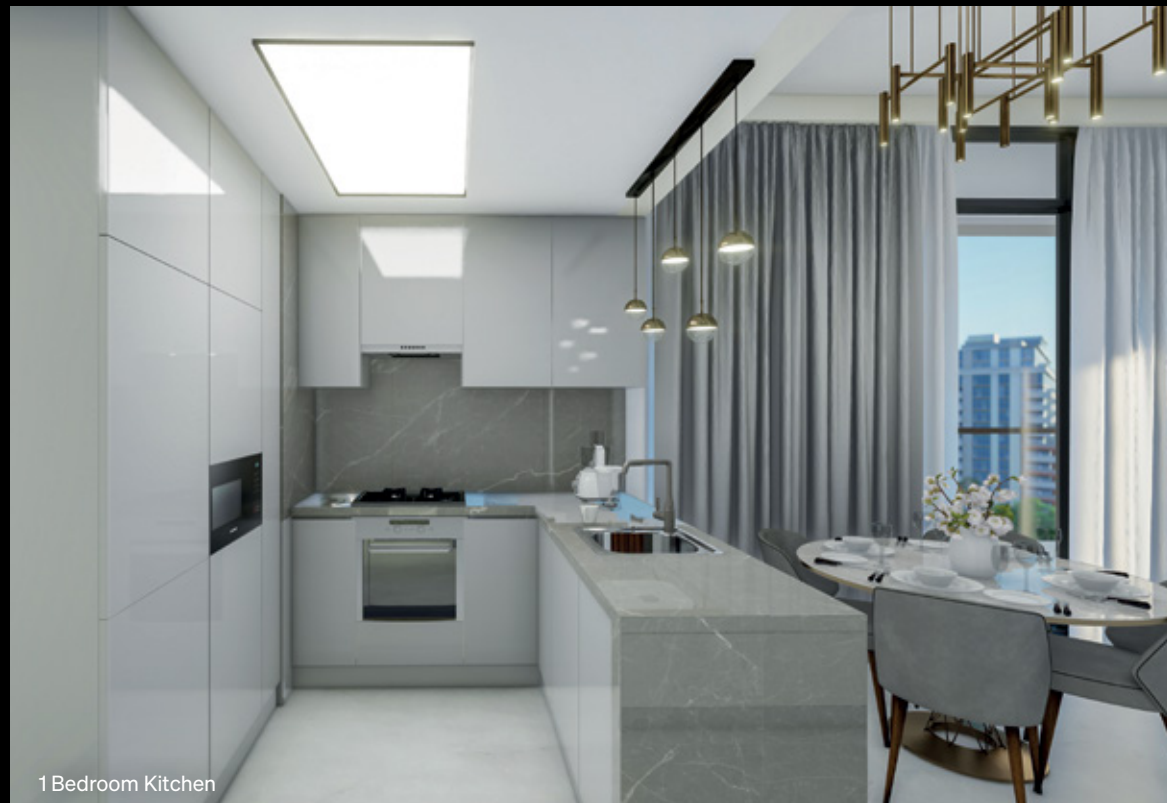
1 Bedroom Kitchen