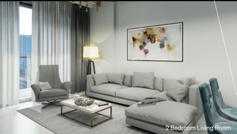
2 Bedroom Living Room

The residential towers will have parking bays allotted for each apartment, in addition to the visitor parking.