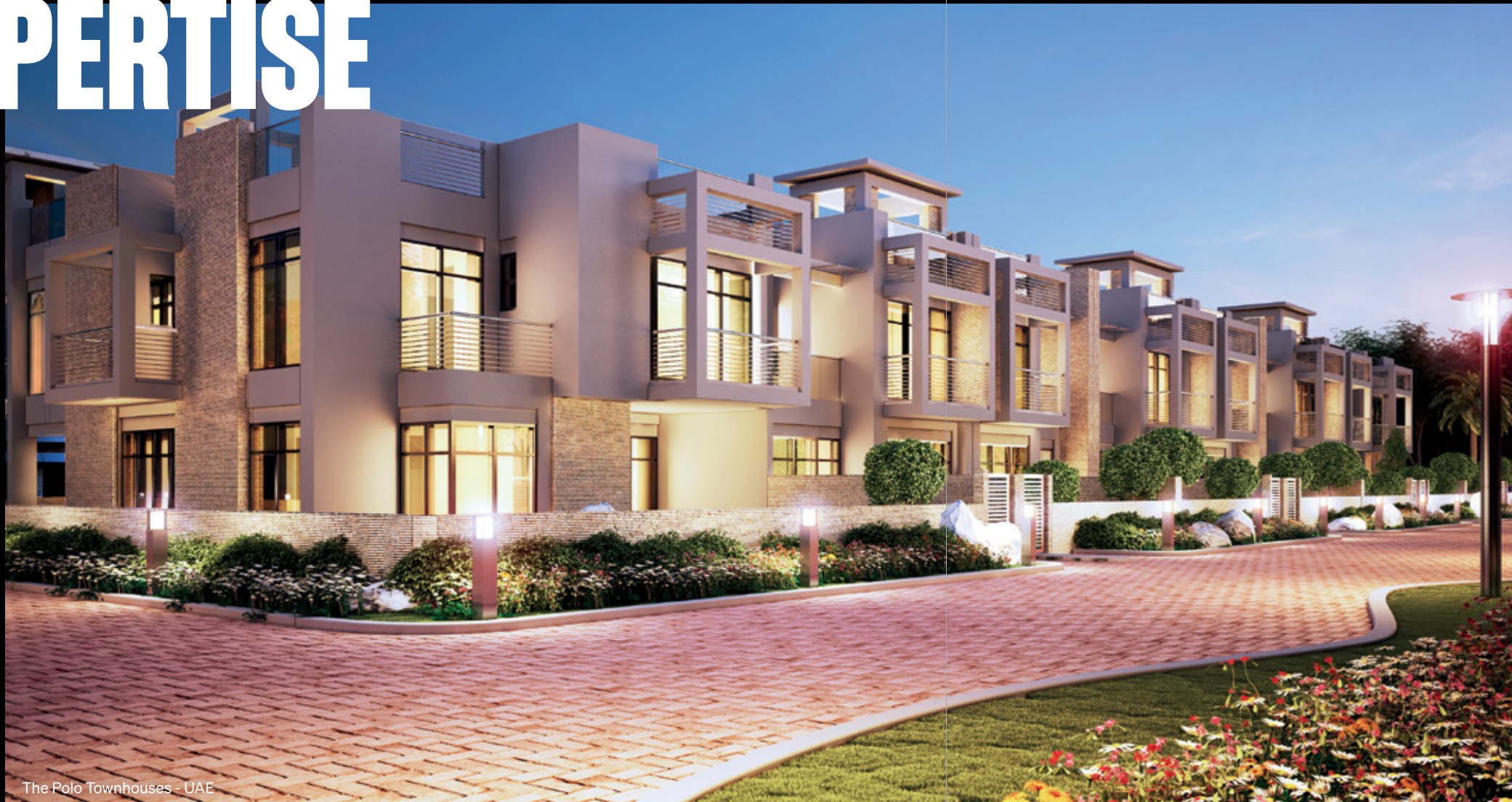
The Polo Townhouses - UAE