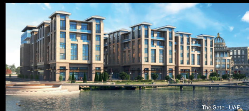
The Gate - UAE

Today, an expanded and impressive portfolio of premium properties, which includes some of the most sought-after properties by meticulous clients worldwide, serve as a testament to IGO's well-deserved reputation as one of the top regional investment companies.